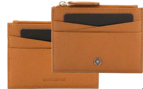
6 credit card slots