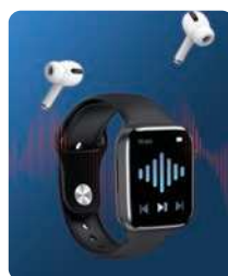
Bluetooth music playback