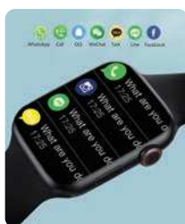
Syncs with your mobile