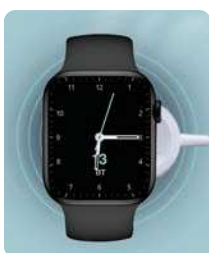
Includes Wireless Charging