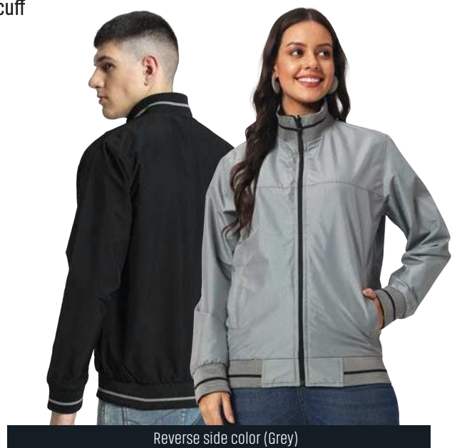
Reverse side color (Grey)

Packing Details : 63.0 x 44.0 x 33.0 cm; 25 pcs / carton; gw/nw: 12kg/ carton