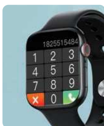
Smart voice calling