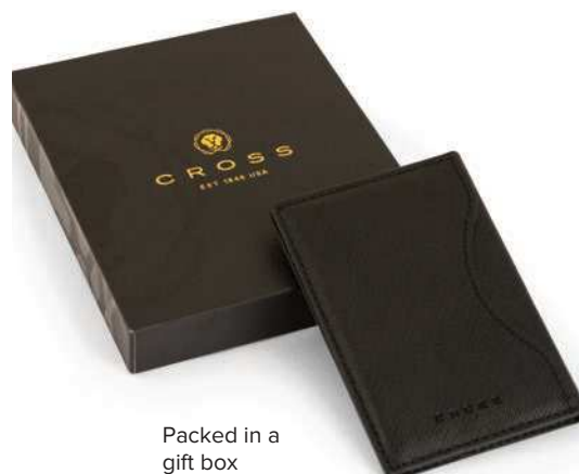
Packed in a gift box