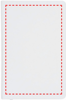
FRONT - FULL SIZE